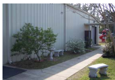
More garden area