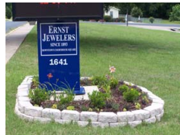
Garden Project under school sign